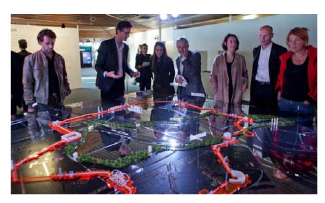
Public participation and consultation