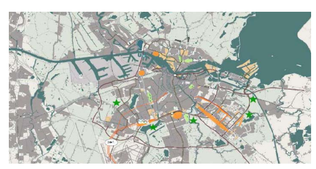
South flank alternative