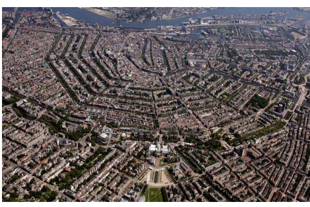
Aerial photo Amsterdam

In a so-called 'structure vision', a long term spatial planning strategy at regional or local level is developed. A structure vision outlines the desired spatial developments of the area that it covers, and also explains which authorities and instruments will be engaged to achieve these developments. It is a guiding document for government, civil society, the private sector and for citizens that clarifies the spatial policy of the territory concerned. Structure visions are an integral part of the broader vision for the future of a municipality or a province.