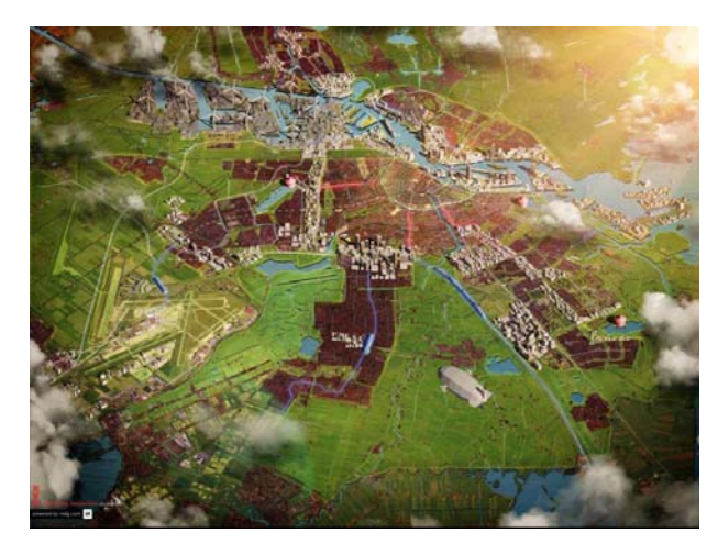
Impression of Amsterdam in 2040

What kind of metropolis do we want to be, what are our qualities? How you can use the strengths of each area? In which way Amsterdam remains livable and green? These kind of questions can be answered with the help of the Structure vision. It is an instrument which shows us the future and which we have made to start a dialogue with the city. "